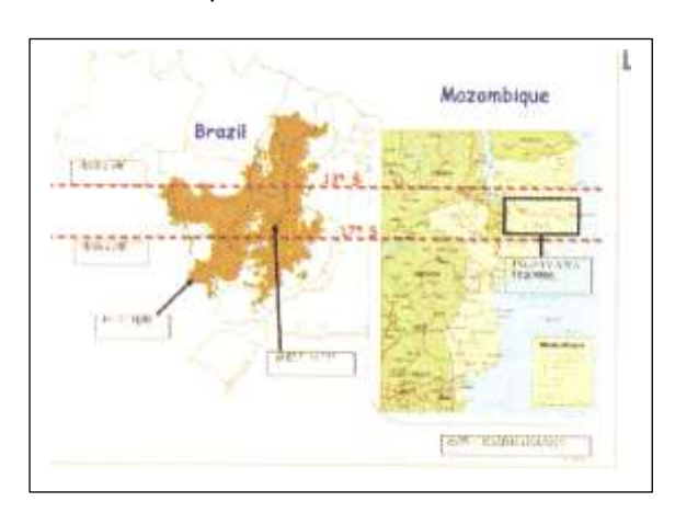
Map 1 JICA's map distributed at an symposium (June 13, 2012)

The "tropical savannah" climate area is limited to the northern region in Mozambique. This is one of the main reasons why the ProSAVANA programme targets Northern Mozambique. For the planner of the ProSAVANA, the geographical similarities between the Cerrado and Northern Mozambique is also evident as seen in the following map, showing the same latitude of these two regions. This argument is used by almost all the JICA documents on ProSAVANA up to now.